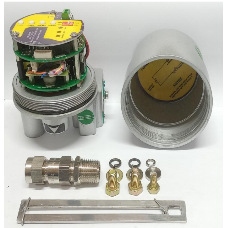
Open view with accessories

RMG-HPT2W-2018 is a Loop powered 2 wire Position Feedback Transmitter, widely used to transmit the position of a Control Valve / Power Cylinder / Electric Actuator in a variety of process control applications. This contactless Hall effect sensor-based Position Transmitter is a 24V DC operated, Angular Position Transmitter designed for both rotary as well as linear movements when coupled with suitable Back Lever and associated hardware. The Position Transmitter processes the input angular movements and gives out 4.00 to 20.00mA signal. This Instrument is certified and qualified for Ingress Protection as per the relevant IS/IEC standards.