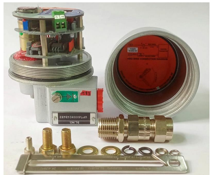
Open view with accessories

RMG-UPT-0501 is a Loop powered 2 wire Position Feedback Transmitter, widely used to transmit the position of a Control Valve / Power Cylinder / Electric Actuator in a variety of process control applications. This contactless Inductive LVDT based Position Transmitter is a 24V DC operated, Angular Position Transmitter designed for both rotary as well as linear movements when coupled with suitable Back Lever and associated hardware. The Position Transmitter processes the input angular movements and gives out 4.00 to 20.00mA signal. This Instrument is certified and qualified for IP 67 as per the relevant IS/IEC standards.