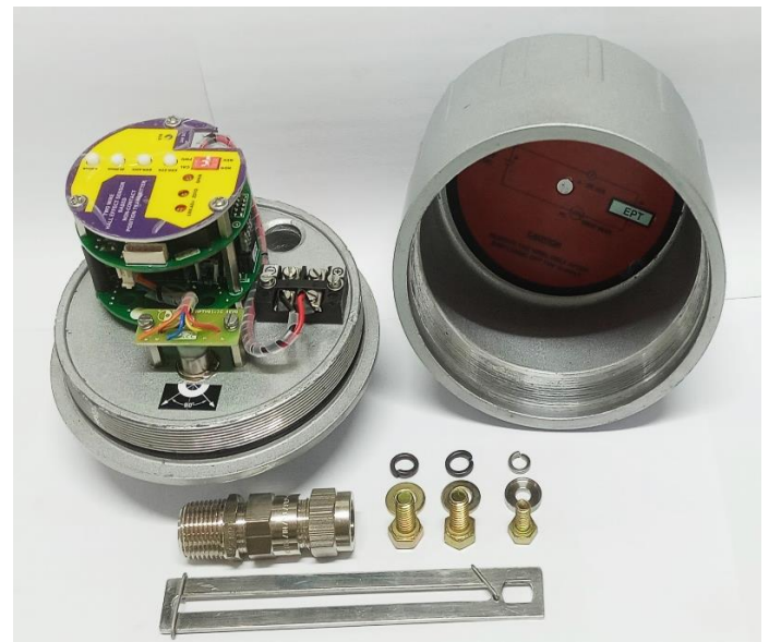
Open view with accessories

RMG-UPT-136H-21 is a Loop powered 2 wire Position Feedback Transmitter, widely used to transmit the position of a Control Valve / Power Cylinder / Electric Actuator in a variety of process control applications. This contactless Hall effect sensor-based Position Transmitter is a 24V DC operated, Angular Position Transmitter designed for both rotary as well as linear movements when coupled with suitable Back Lever and associated hardware. The Position Transmitter processes the input angular movements and gives out 4.00 to 20.00mA signal. This Instrument is certified and qualified for (IP 67) Ingress Protection requirements as per the relevant IS/IEC standards.