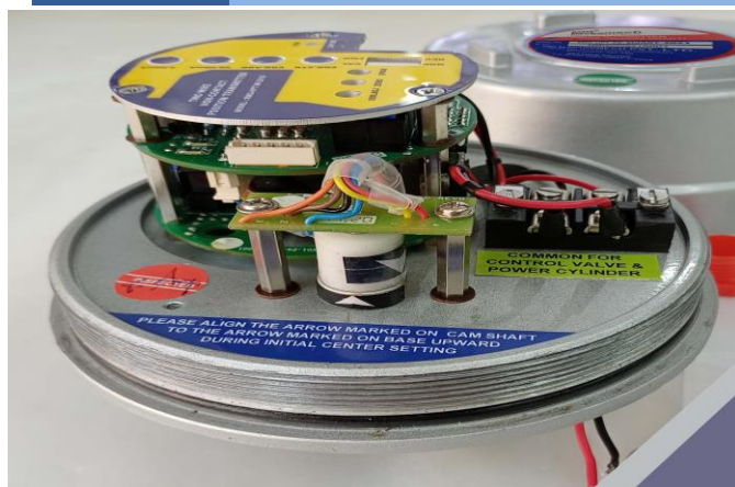
VIEW-TOP COVER REMOVED