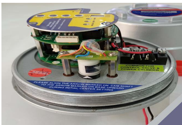
VIEW-TOP COVER REMOVED