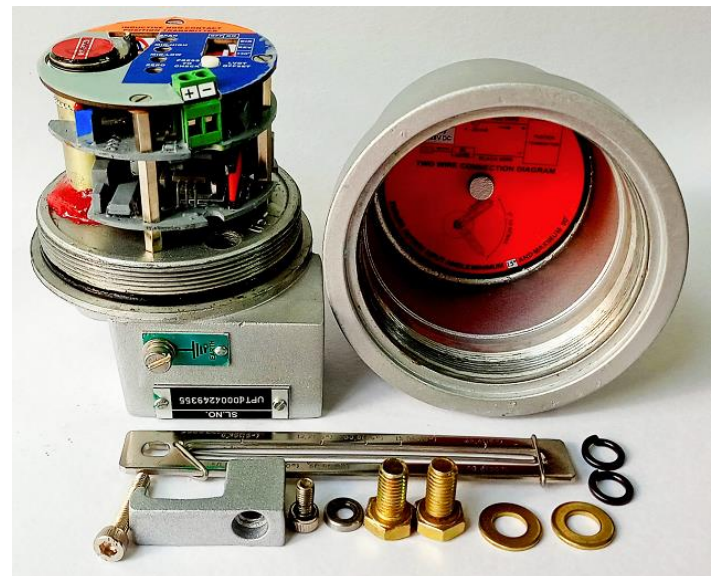
Open view with accessories