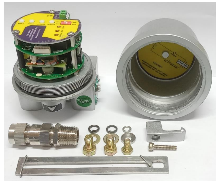
Open view with accessories

RMG-HPT2W-EX-IS-2018 is a Loop Powered 2 wire Position Feedback Transmitter, widely used to transmit the position of a Control Valve / Power Cylinder / Electric Actuator in a variety of process control applications. This contactless Hall effect Sensor based Position Transmitter is a 24V DC operated 2Wire System, using a unique embedded microcontroller-based design suitable for rotary and linear movements as well, when used with appropriate back lever and coupling hardware. The Position Transmitter processes the input rotary signal and converts it into 4.00 to 20.00mA signal. This equipment is Ingress Protection and Intrinsic Safety certified and qualified for use in hazardous environments as per the relevant IS/IEC Standards.