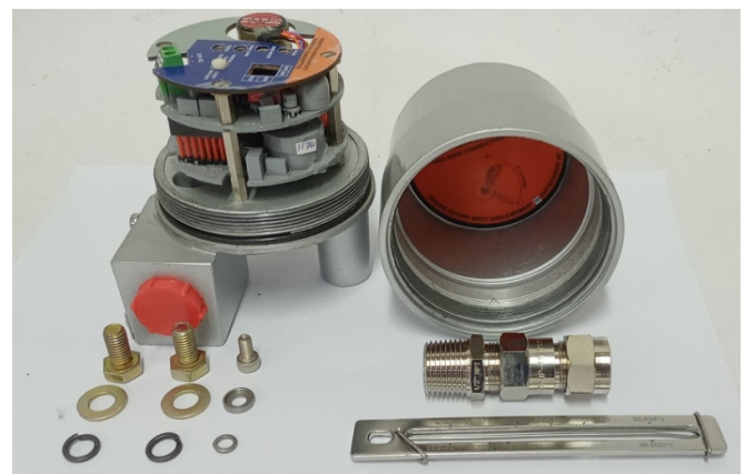
Open view with accessories